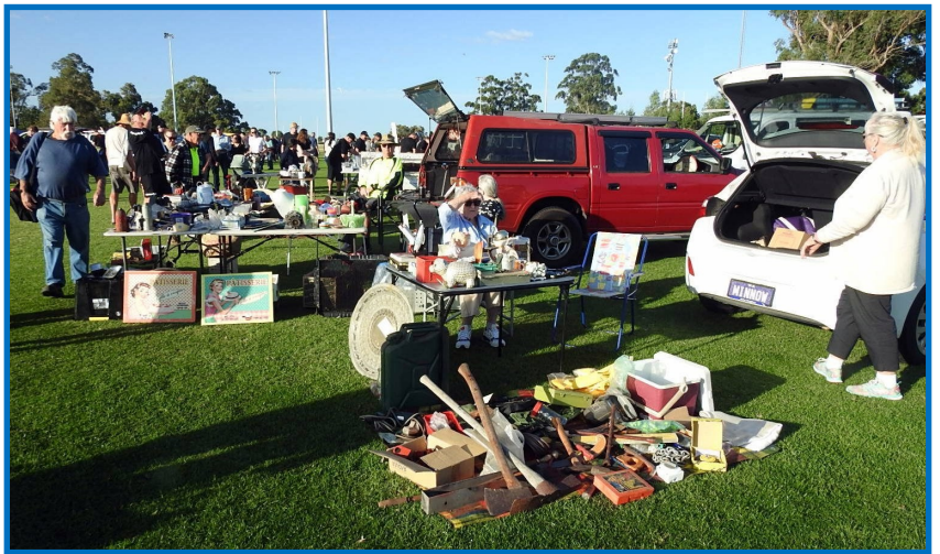
2025 VAA Swap Meet

Please address all mail to 19 Helen St, Bellevue 6056